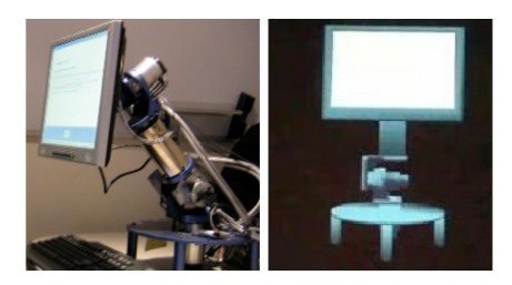
Figure 1. RoCo: a robotic computer (left) and its graphical simulator for designing new behaviors (right)

This paper is organized as follows. First we present a brief description of the new RoCo robotic computer platform to motivate this new desktop technology that moves and can get people to shift their posture naturally while working. Next we offer a summary of relevant psychological literature with respect to body, affect, and cognition interaction effects that informs and guides our work. We then present two novel user studies adapting Riskind's experiment to the RoCo platform. Finally we discuss the findings and conclusions, and suggest future directions.